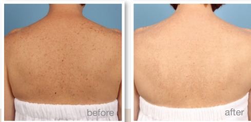
Age/sun spot and photorejuvenation treatment