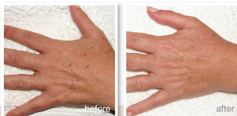
Age/sun spot treatment