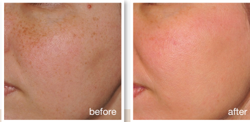
Pigmentation and freckles treatment photo courtesy of Mary Lupo, M.D.