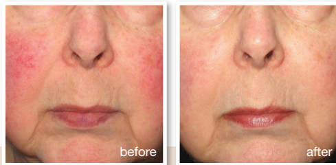
Rosacea and photorejuvenation treatment