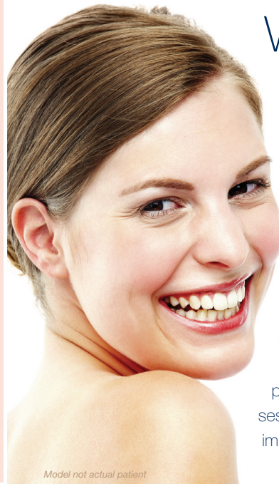
Model not actual patient

Experience minimal downtime in a "lunch-time" treatment and return to your busy lifestyle