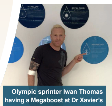
Olympic sprinter Iwan Thomas having a Megabooat at Dr Xavier's

REVIV WELLNESS IV HYDRATION • BOOSTER SHOTS